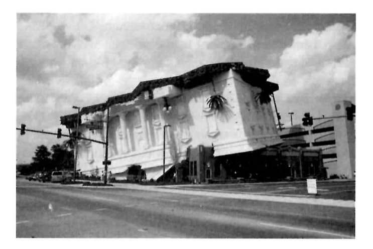
Wonderworks: The Museum of Natural Phenomena, in Orlando, Florida.

What could be more 'postmodernist' than this drawing? If Sterne's Tristam Shandy prefigures the postmodernist novel, then Chambers's drawings predate every ironic trick in American postmodernist architecture of the 1990s – except one: Wonderworks in Orlando, Florida. This Museum of Natural Phenomena was designed by architect Terry Nicholson to resemble a courthouse from the Bahamas which has been picked up by a hurricane and dropped, upside-down, on to a citrus-packing warehouse in downtown Orlando. Designed in the neo-Palladian colonial