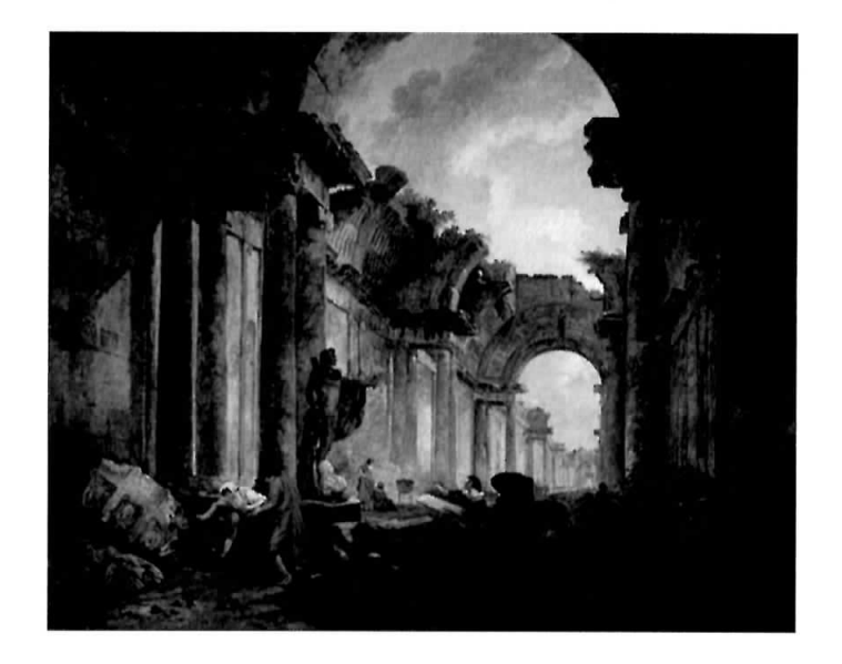
Imaginary View of the Grand Galerie of the Louvre in Ruins by Hubert Robert, 1796. This futuristic view is the first example of an artist imagining how an existing structure might appear after a future cataclysm.

true feelings of this old and impoverished man whose world had been turned upside down, and it is only the famous view of the Louvre in Ruins which gives us an inkling of his inner confusion. At the Paris Salon of 1796 Robert exhibited a design showing the remodelling of the Grand Galerie which runs parallel to the banks of the Seine into a top-lit picture gallery of apparently endless length. Its pendant projected the same view in ruins. An artist is drawing the statue of Apollo while peasants burn picture-frames for fuel. Every detail of this composition – the vault in fragments, the vegetation, artists sharing the ruin with peasants – was