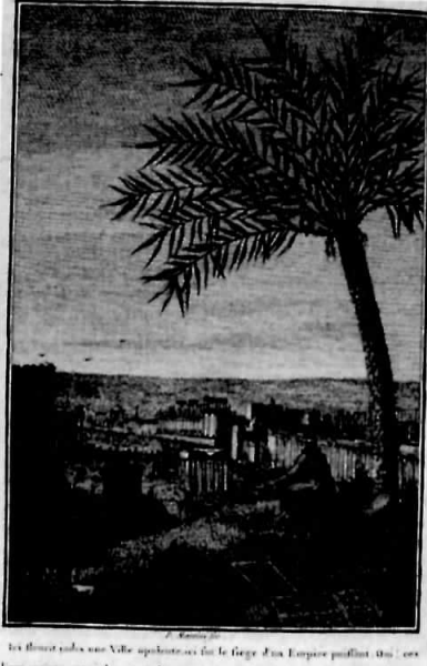
leves mainterant in decerta tadis une malcande sociate animare leur energies de

Robert was the first artist to paint an existing building in ruins. This unprecedented image may have been influenced by the Comte de Volney's Les Ruines, ou Méditation sur les révolutions des empires , published in Paris in 1791. Volney was a deputy in the National Assembly that had been formed