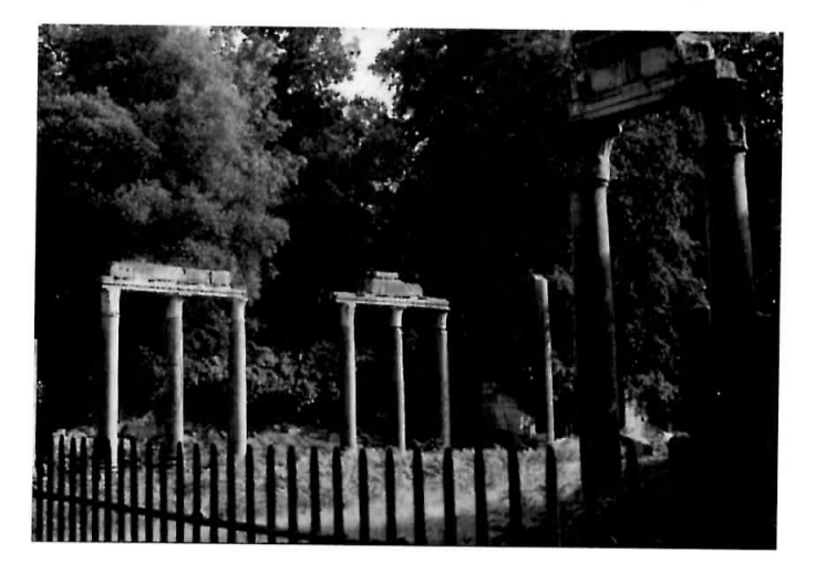
In 1827 the ruins of Leptis Magna, Libya, were re-erected in the gardens of King George IV at Virginia Water.

The obvious solution would have been to build a podium and position the thirty-seven columns as the peristyle of a temple. Wyattville was cleverer. First, he chose as his site a shallow valley running down to the water's edge and spanned by a brick road-bridge. Second, he created an architectural space – or, put another way, the experience of walking through a ruined city. From the landing-stage at the water's edge, where in 1828 the Prince Regent – now George IV, and so fat that he could only waddle – arrived to inspect the folly, we stroll between the two colonnades, under the bridge and into a semicircular temple. Wyattville